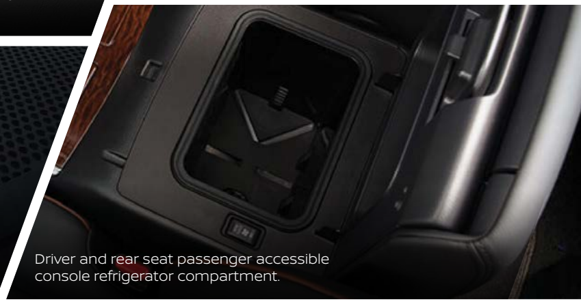
Driver and rear seat passenger accessible console refrigerator compartment.