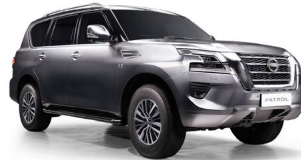
SILVER - K23