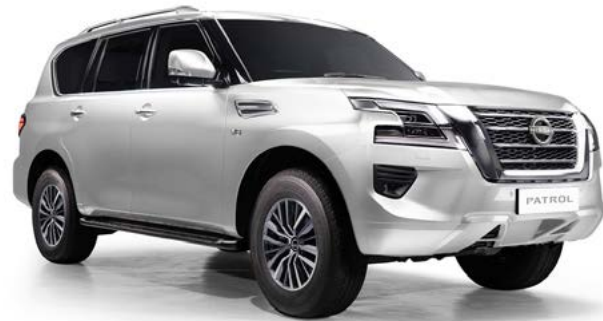
PEARL WHITE - QAB