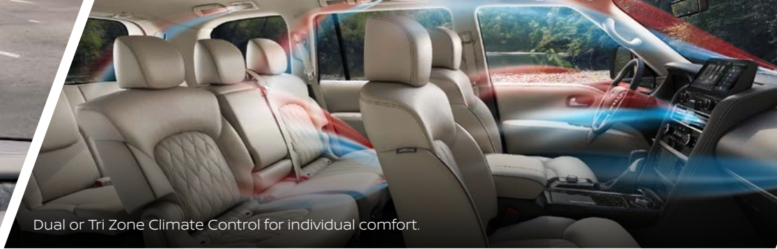
Dual or Tri Zone Climate Control for individual comfort.