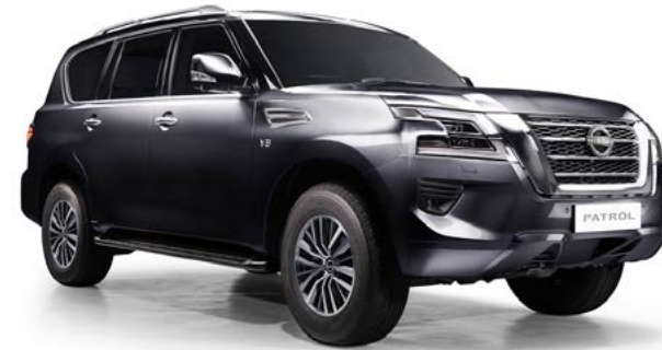
GUN METAL - KAD