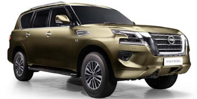
GOLD BEIGE - HAJ