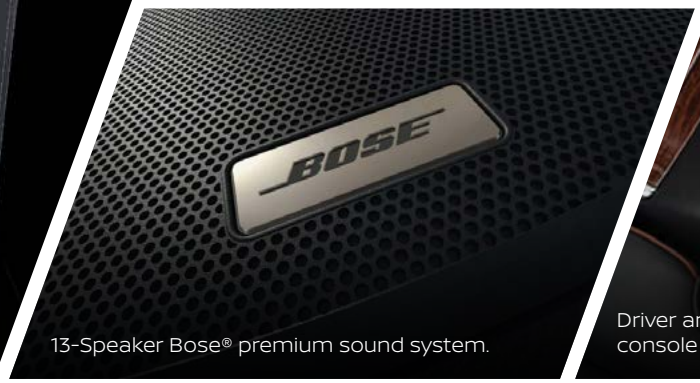
13-Speaker Bose® premium sound system.