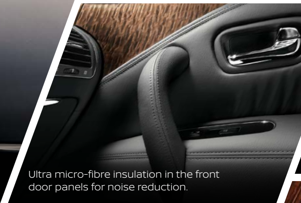
Ultra micro-fibre insulation in the front door panels for noise reduction.