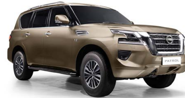
LT BEIGE TPM - HAG