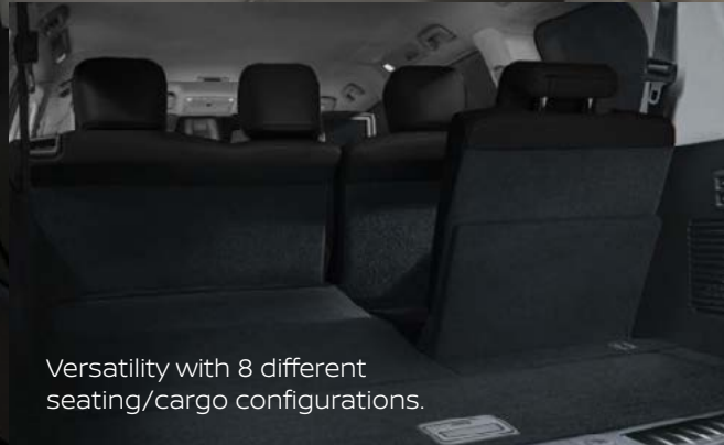
Versatility with 8 different seating/cargo configurations.