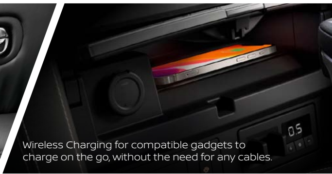
Wireless Charging for compatible gadgets to charge on the go, without the need for any cables.