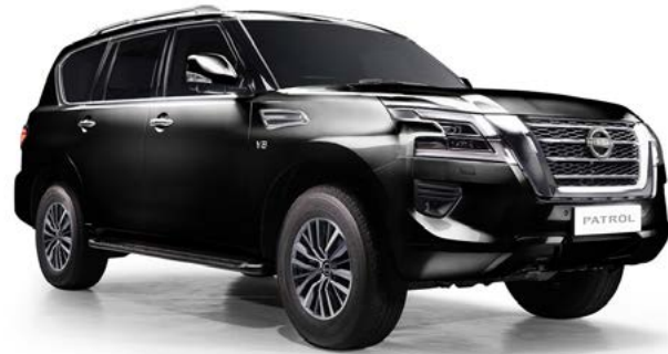
BLACK - KH3